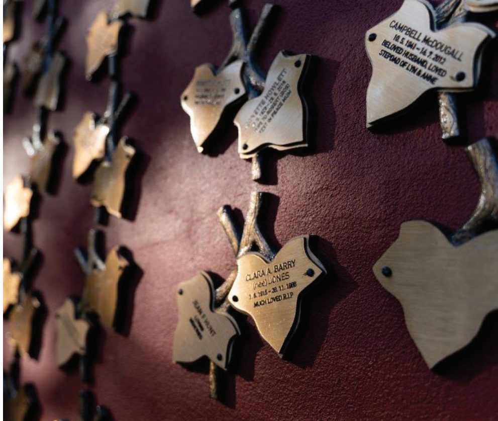
Eternal Vine, Palmdale Memorial Park