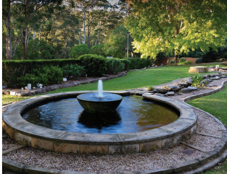
The Ponds, Greenway Memorial Park

Memorial Gardens are designed to be quiet and beautiful places away from the distractions and pressures of everyday life. They are places that