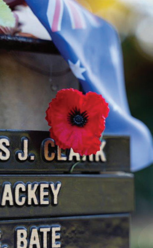
Honour Roll – Army, Navy, Airforce