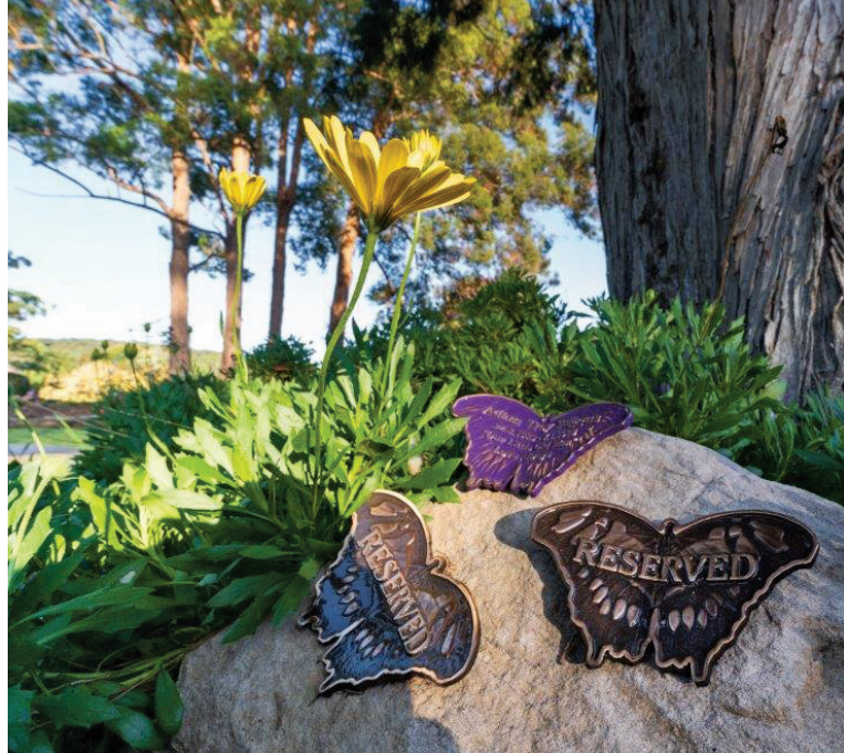
Butterfly Garden of Remembrance, Palmdale Memorial Park

This could be their favourite fishing spot, surf break, the family property, or even a special landmark. However, such a request is often made more in the belief that it is a simple solution for family members and friends, overlooking the need for them to have a memorial for the person they have loved and lost. In fact, many families have told us that in hindsight they would have preferred to retain their loved one's ashes due to the difficulty and trauma the scattering of the ashes caused them and the fact that they had nothing tangible left to honour and cherish afterwards.