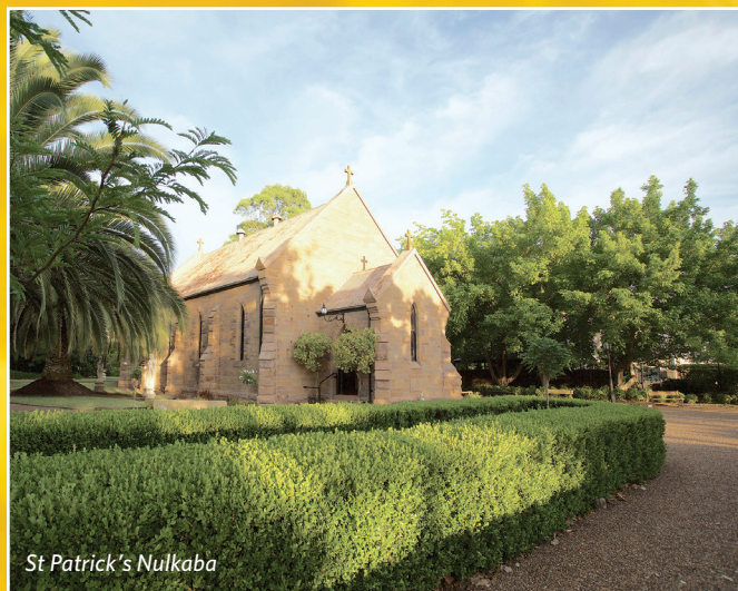
St Patrick's Nulkaba