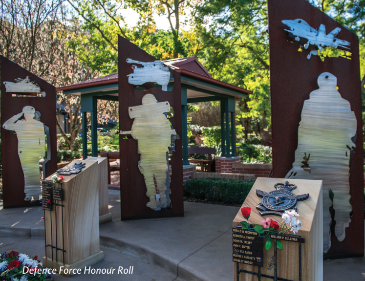
Defence Force Honour Roll